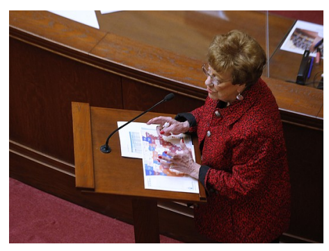
Arkansas does not object to 3judge federal panel hearing